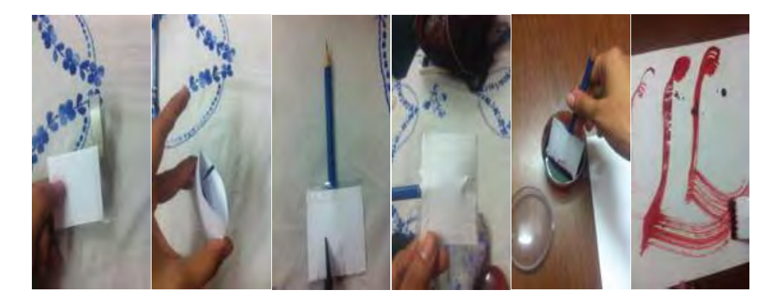
Figure 2: Making of a flat calligraphy tool.

During the process of writing my paper , I gave my students some constraints and had a one day workshop to make them understand as to how to work with "Jugaad" approach. They varied from different specializations and came out with different kind of innovative fix. Three examples are shown here and the rest will be shown in the digital presentation.