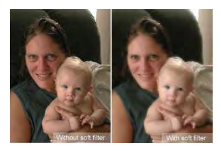
Figure 6: The difference in the picture when soft filter is used

Purpose: It is used to soften the image, mostly used in portraits when we want to soften the face.