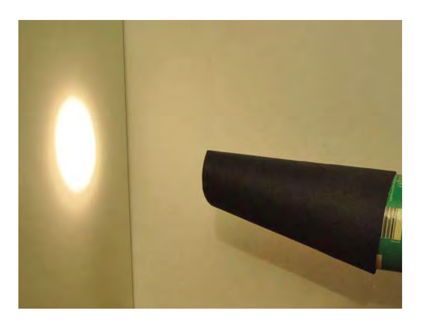
Figure 4: Snoot made from paste paper

Purpose: It is used to concentrate light. Use to light the surface or subject to a certain area or to give a spot light effect on subject.