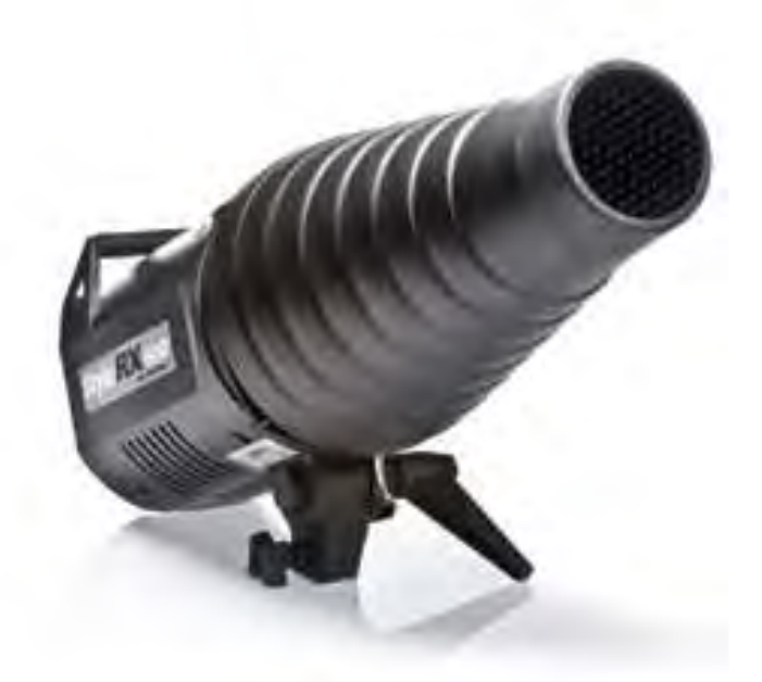
Figure 3: The original metal Snoot

Use of metal "SNOOT" i.e, a cone in shape which is used to concentrate the lights.