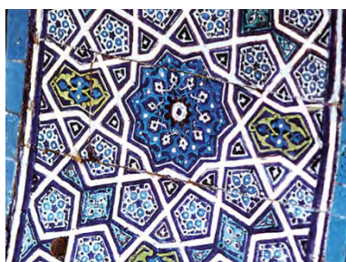
Figure 9. Decorated arch at the Green Mosque in Bursa, Turkey. Image under Creative Commons License.

Carrom or Karrom , it's a board game originally from the Indian subcontinent that later was brought to the Middle East. It consists in a wooden game board with four corner pocked that is played by using a "stricker" that is flicked to hit black and white round pieces (Figure 9). Several students used Carrom pieces to build their narrative, with Figure 4, 1 being one particular interesting case. In this project, the student used a sequence of old Canada Dry cans arranged in a 5x3 grid with one piece breaking the rhythm of the cans and making it the focal point of the composition (Figure 8.1).