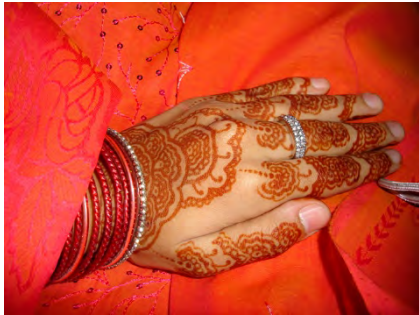
Figure 3. Henna Decoration.

Weddings in the UAE and the Middle East are deeply influenced by the culture and traditions of each family and at the same time differing from each Emirate. Following the tradition, weddings are separated between male and female celebrations, being the female one more expressive and visually interesting than the male. The conventional black abayas (the traditional black over-garment that covers the female body) is replaced by dresses and elaborate hairstyles. In these weddings, food is abundant and usually has a wide variety of dishes including olives, hummous , tabbouleh and sweets as well as tea, coffee and other drinks. The traditional