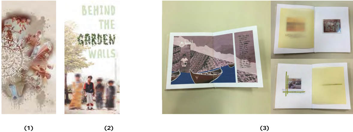
Figure 5. (1) The Smiley Man, Poster, 2015 - Dalal Abdullatif Mohamed Ahmed Mohamed, (2) Behind the Garden Walls, Poster, 2015 - Khulood Mehayer Ali Rashed Suwailam, (3) A Throwback to the Eighties, Booklet, 2015 - Sarah Omar Saeed Obaid Almatrooshi.

Behind the Garden Walls , explores the link between cousins and neighborhood friends by telling the story of 4 children that used to play at Safa Park , one of Dubai's biggest and oldest park. One important element in this composition is the use of a blurring filter to disguise the identities of the other three female children in the photo. This is not only to make the main character in the story the focal point, but also to conceal their identity in some sort of cultural shyness to avoid personal clashes. (Figure 5.2).