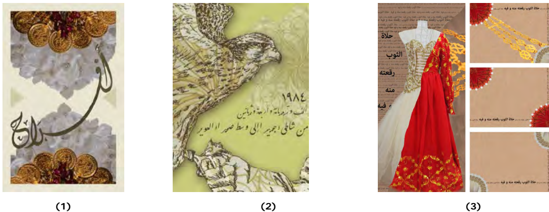
Figure 2. (1) Afrah , Booklet, 2015 - Maryam Maktoum Mohamad Hasher Al Maktoum , (2) Meeting of the Desert and the Sea , Postcard, 2014 - Sana Hasher Hamad Juma Almaktoum . (3) Red Dress , Poster and Postcard, 2015 – Alia Hamad Ibrahim Khalfan Ali .

Laylat al Henna or Henna Party is the prelude of the wedding celebrations and takes place one day or two before the actual ceremony at the bride's parent's house (Hamid, 2002). Henna is a natural dye that comes from dried Mignonette Tree leaves mixed with boiling water. This dye is used to create temporary body art in India, North Africa and the Middle East (Figure 3).