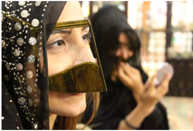
Figure 10. Emirati Burqa. Ahmed Alromaithi. Image under Creative Commons License

including face, is a piece of decoration that only covers the woman's forehead and upper lip imitating the features of a falcon, a symbol of pride in the region (Figure 10) (Nuriyah, 2013). Each country in the gulf has its own type of Burqa. The Emirati one has a narrow top and broader curved bottom. Gulf Burqas are made from blue or purple fabric with a metallic finish imported mostly from India. Even when this accessory is not commonly used anymore by younger woman, its regarded as a piece that belongs to older generations and represents experience and respect (Al Hameli 2014, Al Khan 2007, Kanafani 1979).