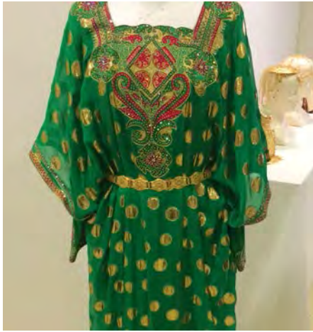
Figure 4. Traditional Emirati Thawb.

repeated throughout the pieces to represent the female character of the story juxtaposed to the falcon, which represents the male side of it.