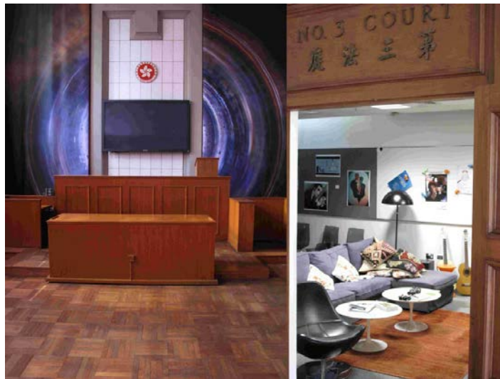
Figure 5. The court houses are preserved and turned into lecture halls and studios.