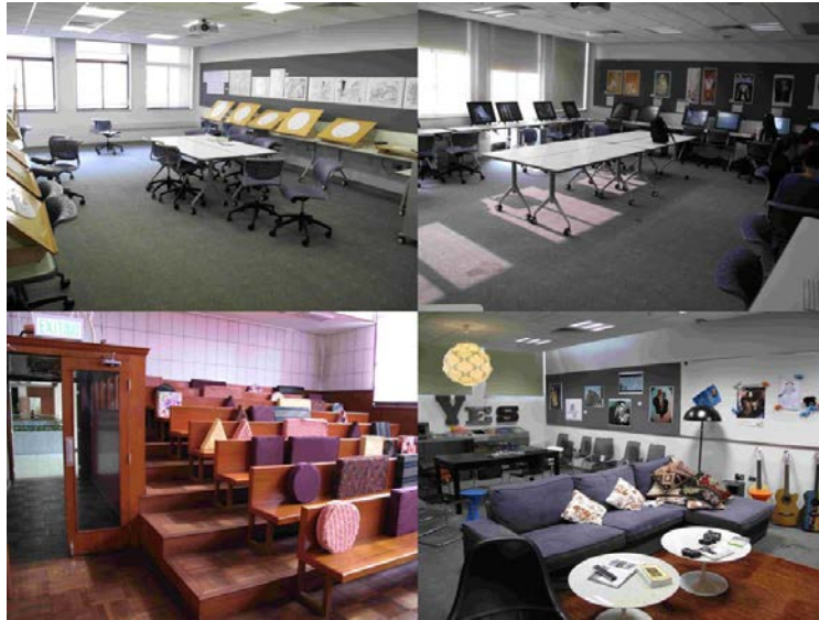
Figure 7. The court houses are preserved and turned into lecture halls and studios.