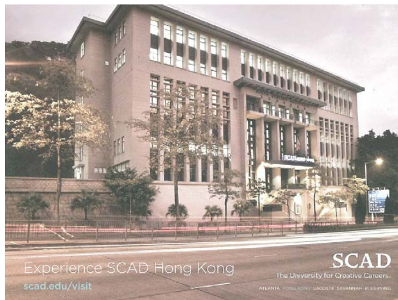
Figure 2. The building of SCAD is a historical building and it served as the North Kowloon Magistracy in the 1960's.

Responses to the questionnaire's item 2) about the architecture informed that the location of SCAD "is a historical building and in the 1960's it served as a court house as one of nine Kowloon districts and it is an iconic authority building" (Figure 2, 3).