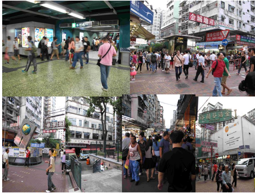
Figure 1. The Sham Shui Po community

Responses to the questionnaire's item 2) about the architecture informed that the location of SCAD "is a historical building and in the 1960's it served as a court house as one of nine Kowloon districts and it is an iconic authority building" (Figure 2, 3).