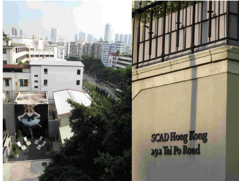
Figure 3. SCAD Hong Kong